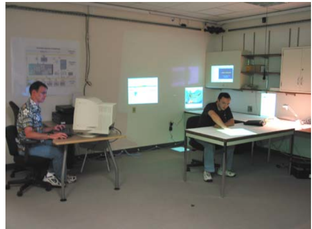
Figure 2. An overview of the experimental setup (prior to installing the “round table”). The “wizard” is seated at his control station on the left, and a researcher is playing the role of a participant on the right. Note the projected images on the wall, desk, and floor surfaces.

We performed the user study in one corner of a dedicated projection lab (see Figures 1 and 2). We placed several pieces of furniture in our simulated office space to resemble a typical individual office layout. The researcher guiding the participant through the study was seated at a video recording and system monitoring system across the desk from the participant. The “wizard” sat behind the participant as a monitor, which displayed multiple live camera views of the simulated office. (This perspective, together with the “wizard’s” knowledge of the participants’ intentions, enabled the “wizard” to evoke convincing feedback in response to their interactions. In debriefing, 5 of 9 participants reported that they believed the system was a fully-functional implementation.) Participants were led to believe that the “wizard’s” presence was necessary to provide