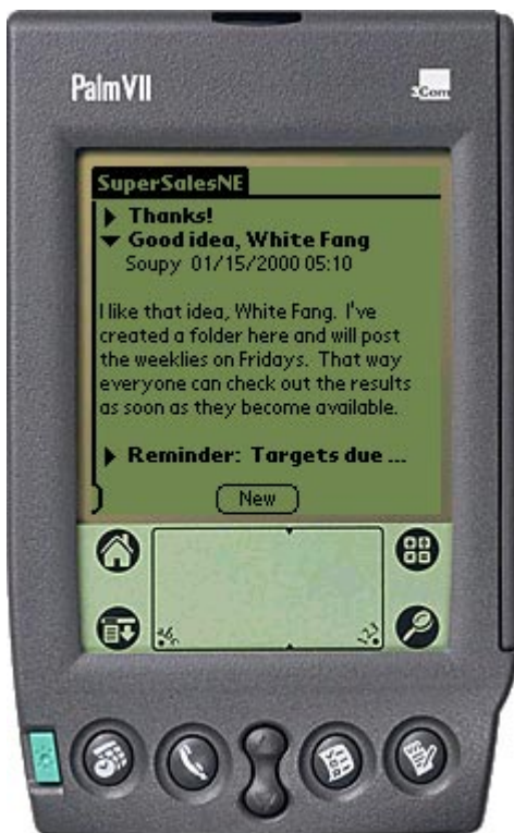
Viewing a Quickplace discussion thread.

historical information necessary to “get up to speed”.