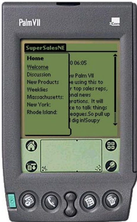
The QuickPlace navigation drawer makes effective use of limited screen real-estate.